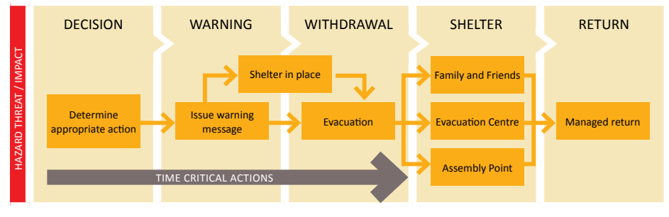
Figure 2. Five stages of evacuation. Reference: Queensland Evacuation Guidelines, 2011<sup>1</sup>.

In response to a threat, Queensland government authorities will initiate a fivestage evacuation process. The first three stages involve determining appropriate action in relation to the emergency, issuing warnings and evacuating. Shelter is considered the fourth stage and includes community members accessing safety, including in nominated safer locations away from the potential hazard or area of impact. LDMGs are responsible for nominating these safer locations. Return is the final stage in the evacuation process which requires the careful panning and management of people in the return to their homes and community.